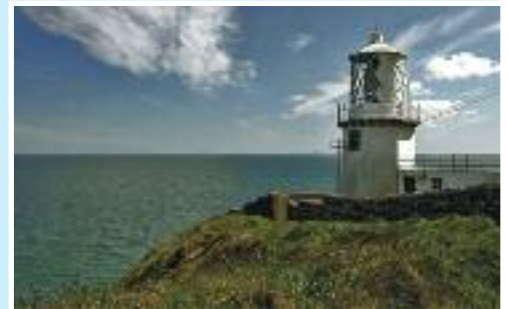
doghouse (028 9187 3655)