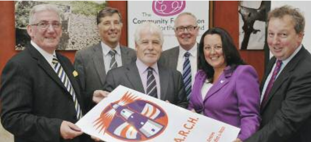
Politicians and community activists at the SEARCH Celebration Launch (see page 3)

South East Antrim Resourcing from Conflict to Hope