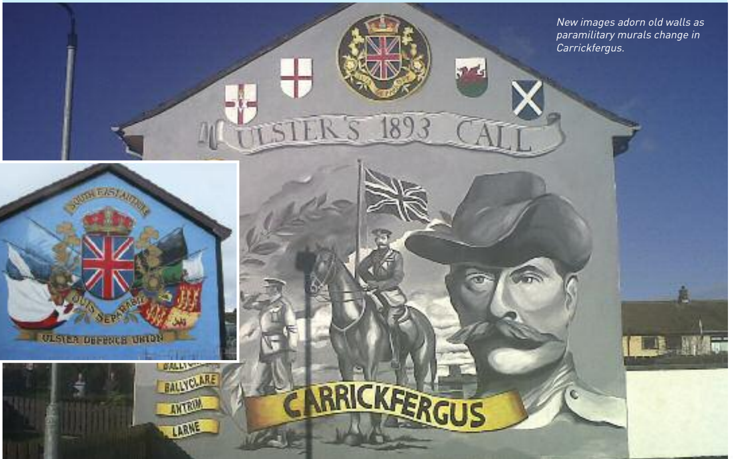
New images adorn old walls as paramilitary murals change in Carrickfergus.

It would be beneficial to have this service delivered in other areas of South and East Antrim and the Project will now attempt to establish a community dentistry service as well.